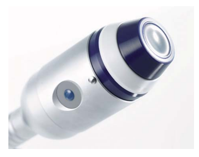
Figure 1. C-Actor handpiece of the Duolith SD1 system.

Each patient received between 3 and 26 shock wave therapy sessions (average number of sessions: 8) between 2 and 92 months after the surgery (average: 27 months). In general, treatment was performed at weekly intervals. The average overall duration of the shock wave therapy was 13 weeks (3–40 weeks). Ten patients received 1,000 shock waves per therapy