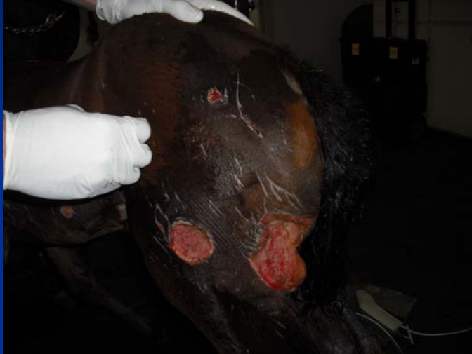
Baseline 9/4/08 – 600 Pulses