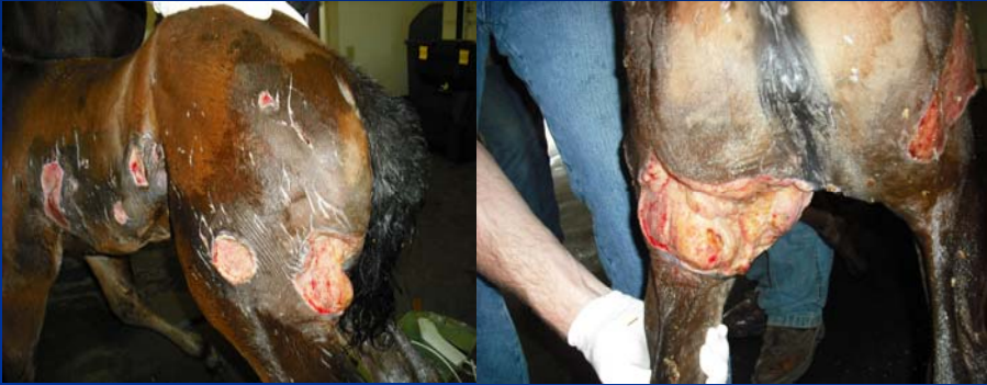
9/4/08 – Baseline – 2400 Pulses Applied