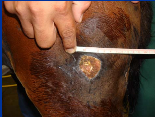
9/18/08 – 300 Pulses