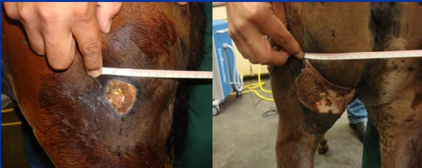
9/18/08 – 1600 Pulses Applied