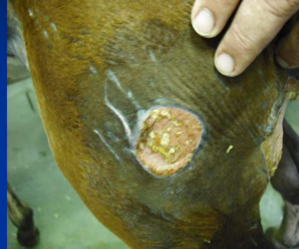
9/11/08 – 600 Pulses