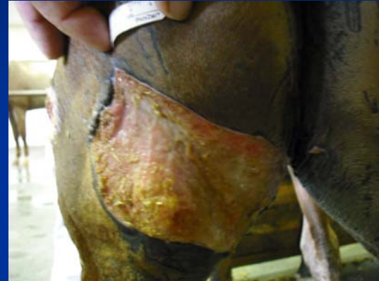
9/11/08 – 2000 Pulses Applied