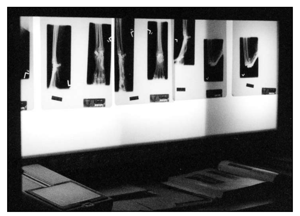
A complete veterinary examination – and, usually, radiographs – are required to help determine treatment.

Protocol varies, but commonly anywhere from one to four treatments are done, two weeks to a month apart. The dog may be a little more sore for a few days following treatment, though sometimes the opposite is true and the treatment produces a short-term anesthetic effect, during which time you must be careful that your dog doesn't overdo it. Improvement may be seen right away, or it may take a few weeks to see the full effects of the treatment. The process may need to be repeated around once a year.