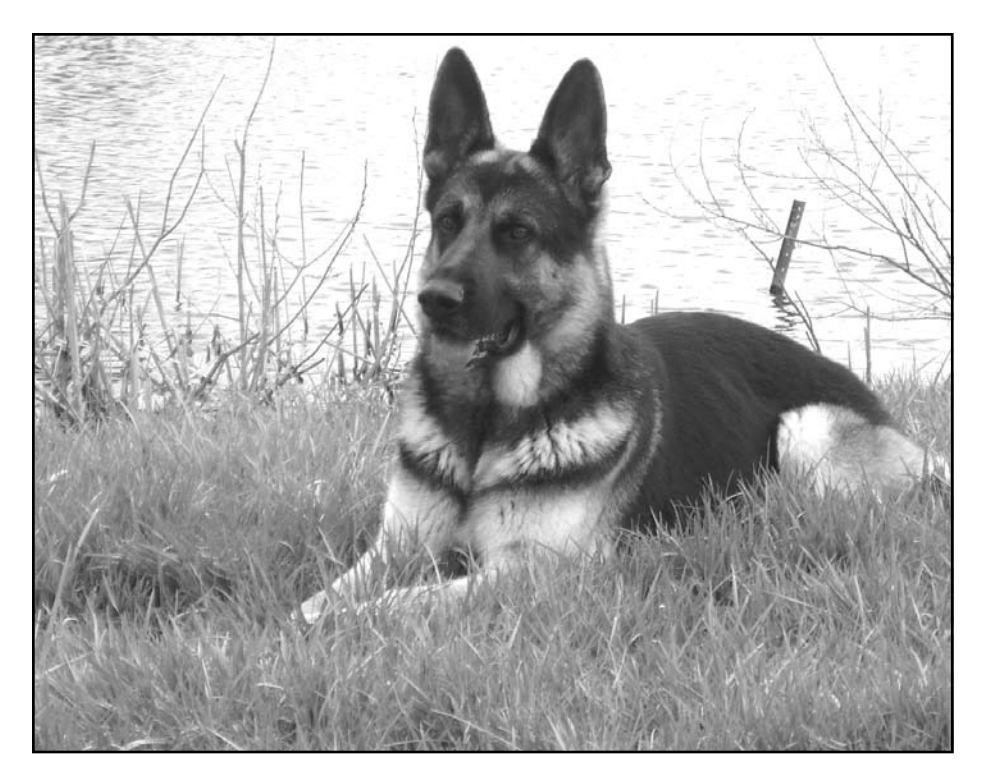
Zeus started out as a search and rescue dog, but was retired at age three years, due to hip dysplasia and elbow problems. Shock wave therapy has helped him regain about 80 percent of normal function as an active "civilian."

intensity of the pressure waves, which cause less pain than higher-intensity waves. Most studies in the U.S. have been done using ESWT, which are the only devices approved by the FDA for treating humans. Both device types are widely used in Europe.