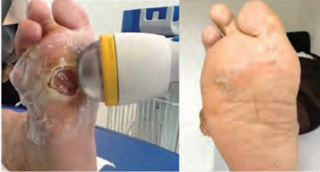
62 yr old DFU patient after 4 SoftWave sessions

Modulates inflammation Increases blood supply Promotes angiogenesis Stimulates cytokines and growth factors Wound epithelialization Tissue regeneration