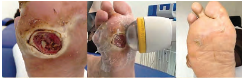
62 yr old DFU patient after 4 SoftWave sessions

SoftWave's DermaGold 100® is a proven option for patients with chronic wounds not responding to standard of care. It is convenient for both patient and provider. SoftWave treatment has a reimbursement pathway with CPT Codes 0512T and 0513T. For more information, email sales@softwavetr.com .